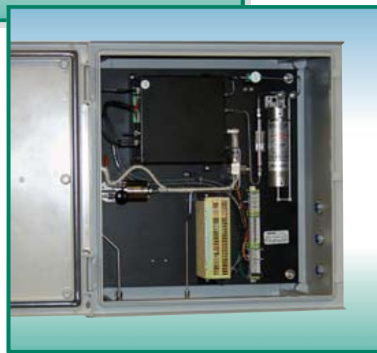
Model 3050-OLV in a black box configuration, top NEC Class I, Division 1 explosion-proof enclosure, center NEMA 4X weather-proof enclosure, bottom