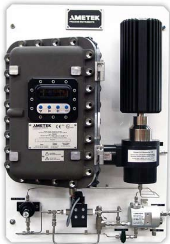
Model 241CE II Hydrocarbon Dew Point Analyzer - European version shown

A fully integrated sample system package, including proprietary multiple stage filtration specifically designed for natural gas samples, protects the analyzer from common natural gas contaminants (aerosols, particulates and liquid slugs) and ensures reliable, fast, and accurate means of detecting the hydrocarbon dew point temperature in natural gas applications.